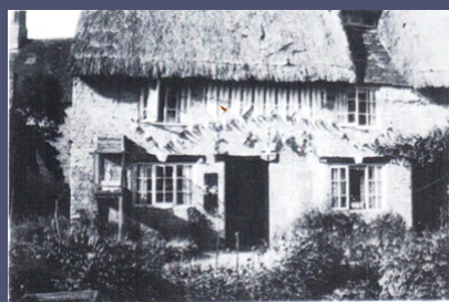
Our house decorated for the Queen's coronation 3rd June 1953 No 2 & 3 The Jetty Cross Tree Rd. Demolished circa 1962 House to the left is back of the property now called The Old Bakery.

We all enjoyed the novelty of campfire cooking and especially good camping evening activities, including campfire singalongs. I am sure some our readers will know of the horrible songs sung by Scouts. Sunday evening pushing all the gear back to Stony unloading, storing, and the weary bike ride home.